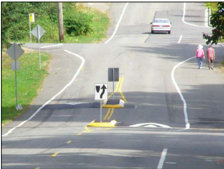
Existing Split Speed Humps

Through an evaluation survey, 94% of respondents supported the permanent installation of the split speed humps on 116th Ave SE, between SE 64th St and SE 65th Pl (see map on page 3). Therefore, we will be replacing the temporary medians with landscaped islands within the next few months. The speed humps will be removed and reinstalled during the upcoming resurfacing of 116th Ave SE (see page 5 for more information).