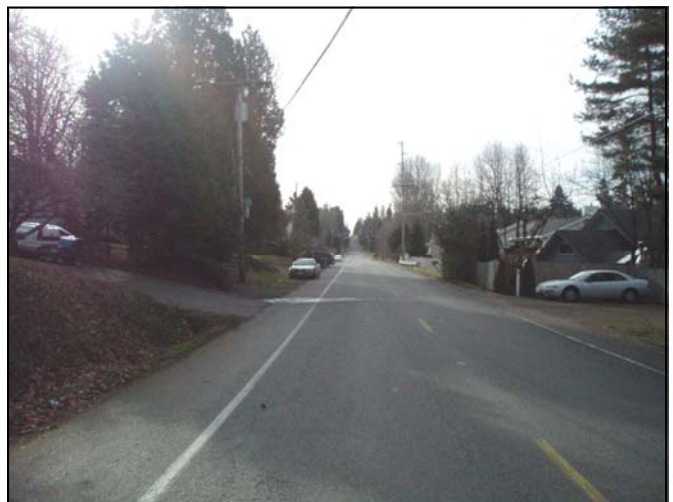
116th Ave SE, south of SE 60th, Location of New Sidewalk