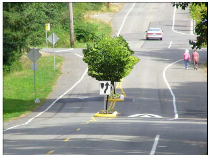
Conceptual of Landscaped Medians